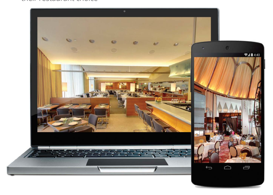
Tour business interiors with Google Maps Business View on desktop, mobile, and tablet devices